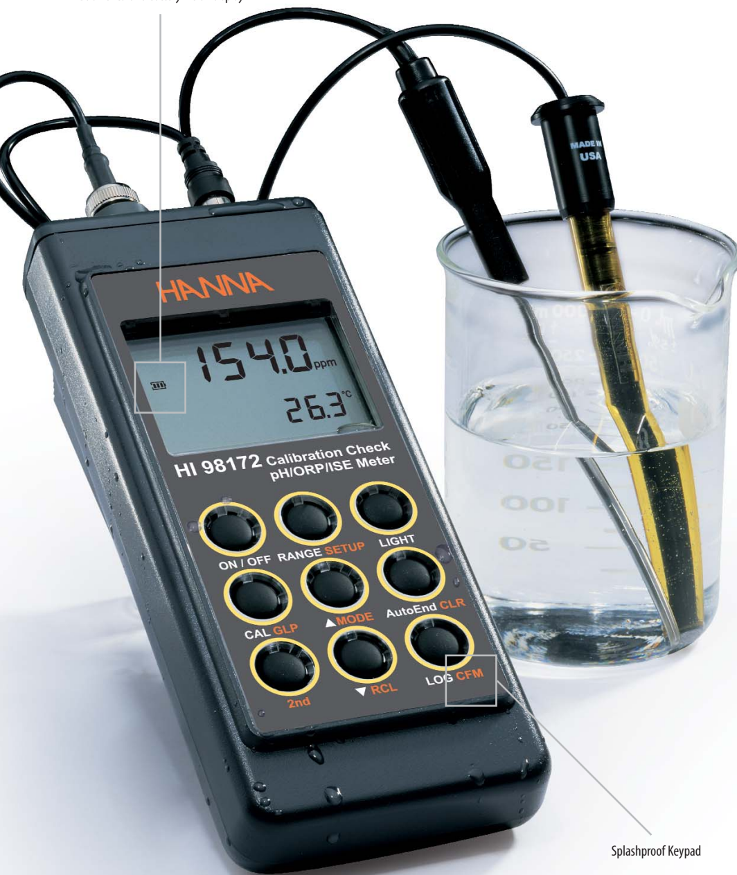
Backlit LCD and battery life on display

Model HI 98170 offers accurate pH measurement while HI 98171 includes ORP to its range and HI 98172 measures ISE in direct ppm and has 5 point ISE calibration. All models are supplied in a hard carrying case with pH and temperature probes included.